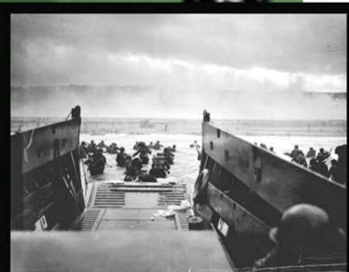
Allied Forces storm the beaches of Northern France