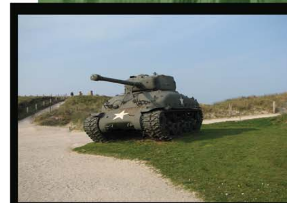
Allied Forces' tank used during World War II