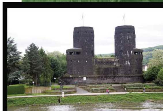
Remagen Bridge, Remagen