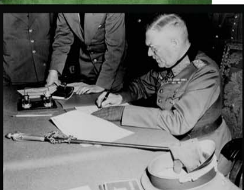
German forces signing their official surrender to Allied forces