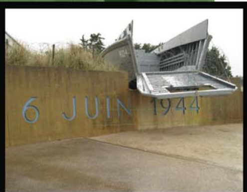
Invasion of Normandy memorial