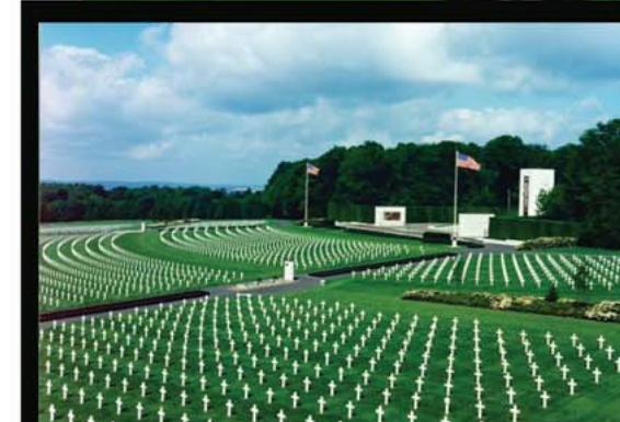
Luxembourg American Cemetery & Memorial

Today you bid farewell as your motorcoach transfers you to the airport for your return flight to Washington Dulles, taking with you so many wonderful memories of your Battlefields of World War II tour!